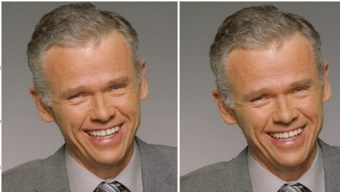
Fig 2: The DFE should be able to handle artifacts that affect print quality, such as missing nozzles and banding.

Furthermore, the DFE should incorporate automation capabilities to handle production artifacts that can affect print quality, such as missing nozzles and banding. By automating the identification and correction of such issues, the DFE helps maintain optimal print quality throughout the production process. This reduces the reliance on manual intervention and minimizes the chances of errors or inconsistencies in the final print output.