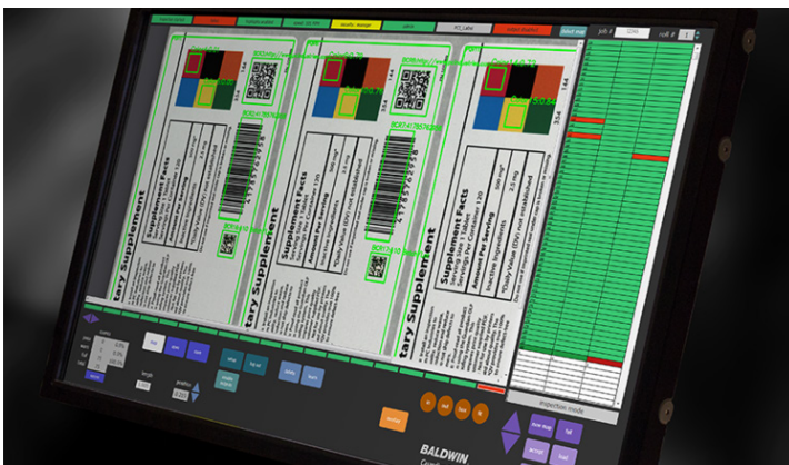
Fig 4: Printing inspection systems, such as those manufactured by Baldwin Vision Systems, make it possible to eliminate all defects, providing perfect quality to brand owners.

The second function focuses on inspecting the final product. This camera system carefully examines each product to ensure proper printing by reading text and barcodes, and comparing them with a database for accuracy. It also checks print placement, detects missing objects, and evaluates color variations. Importantly, the DFE must generate an output stream that aligns with the print stream going to the press, using RGB format instead of CMYK or Extended Gamut. This enables the camera system to efficiently process large amounts of raster data from the DFE and the camera without requiring the conversion of the CMYK stream to RGB, simplifying the inspection process.